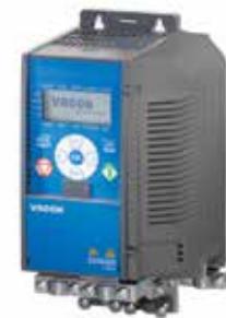
OPTION BOARD MOUNTING KIT