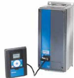
KEYPAD DOOR MOUNTING KIT